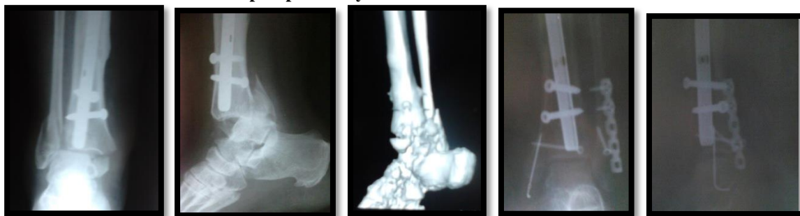
Figure 2 Showing pre operative and post operative X rays in case of trimalleolar fractures fixed with cancellous screws and one third tubular plate. Preoperative CT has also been shown.