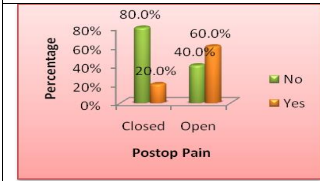
Figure.1 Shown Post Operative Pain