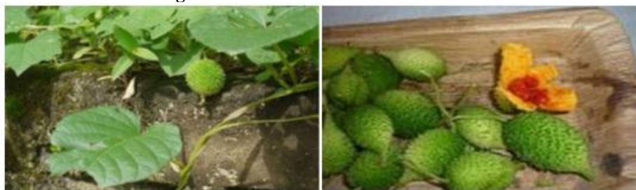
Figure 1. Fruit of Momordica dioica Linn